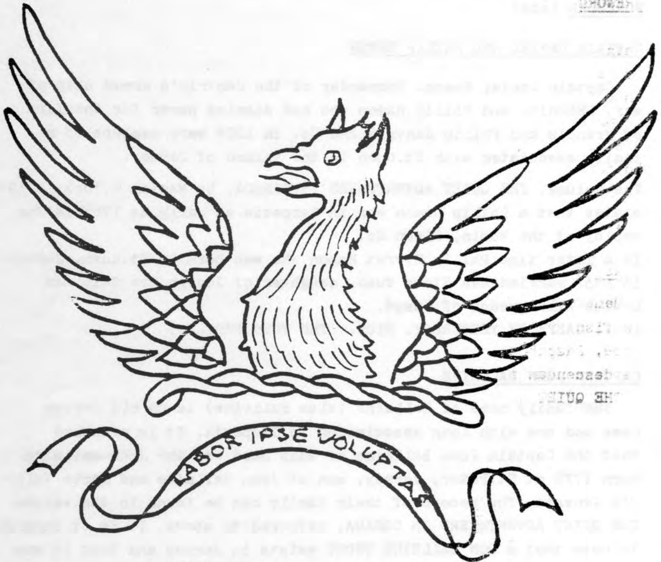
JANVRIN FAMILY CREST (The Phoenix)